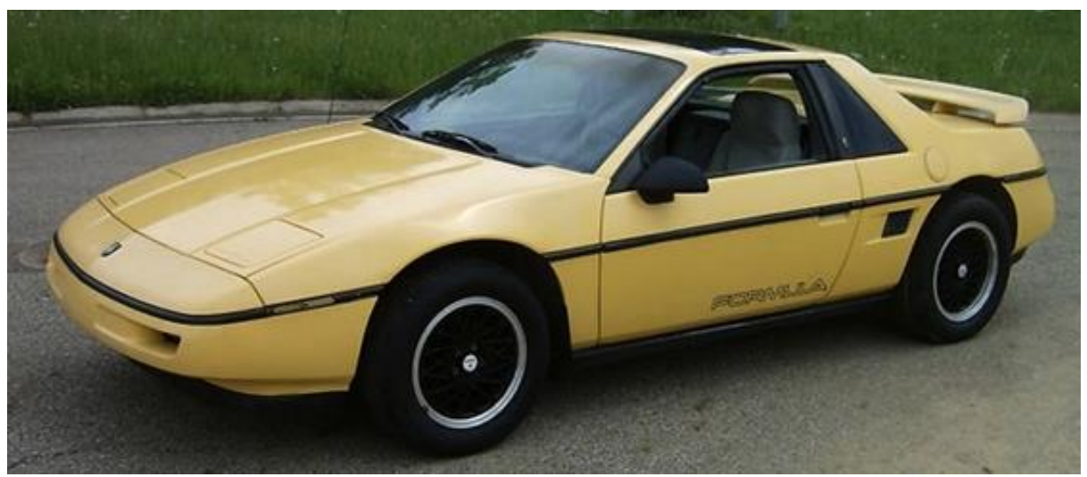
1988 Fiero Formula – 5,484 total units produced (manual and automatics).