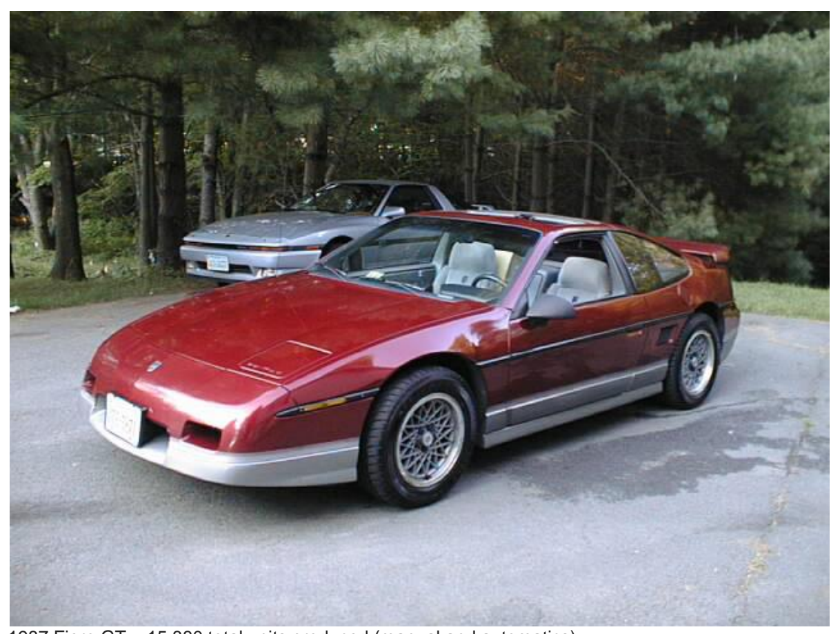
1987 Fiero GT – 15,880 total units produced (manual and automatics).