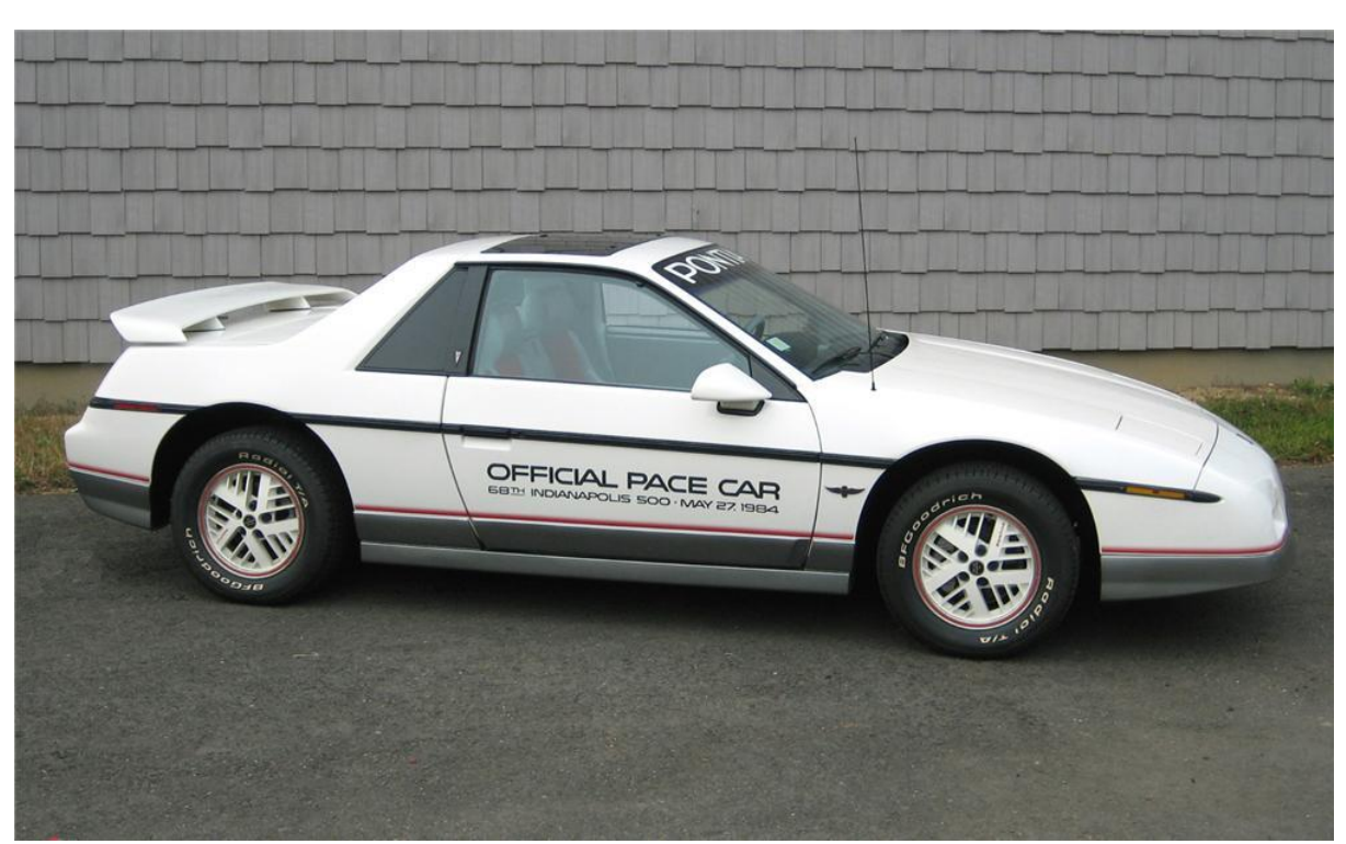
1984 Fiero Pace Car – 2,001 total units produced (manual and automatics).

So what are the range of prices for these sought after Fiero Models?