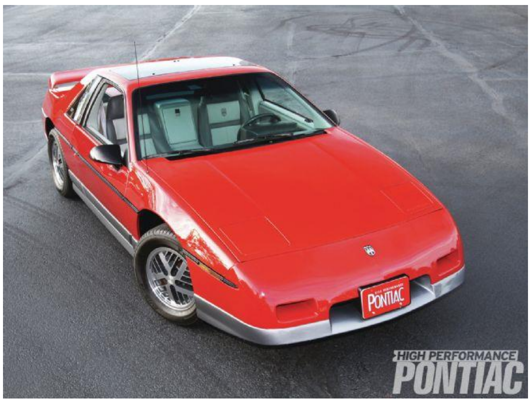
1985 Fiero GT - 22,534 total units produced (manual and automatics).