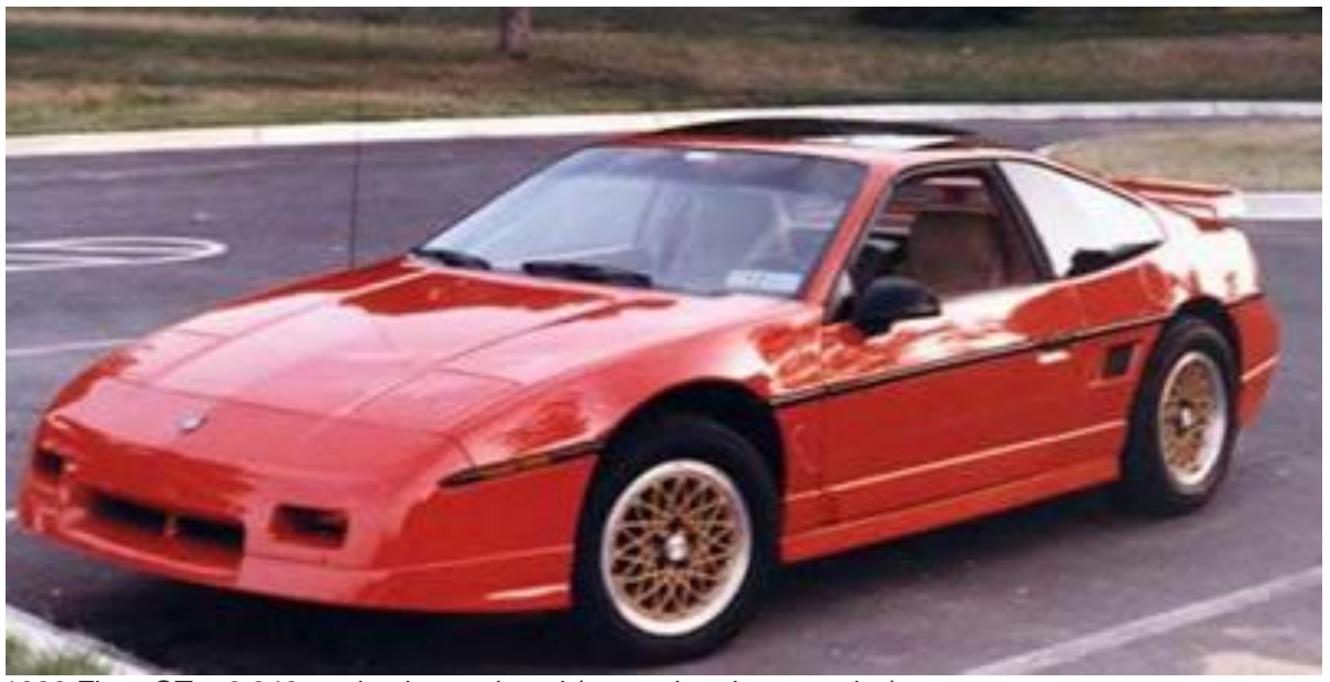
1988 Fiero GT – 6,848 total units produced (manual and automatics).