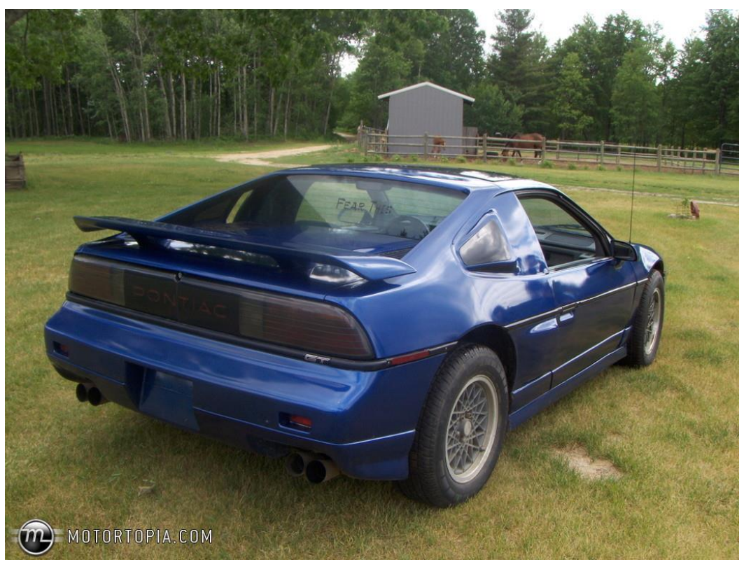
1986 Fiero GT – 17,891 total units produced (manual and automatics).