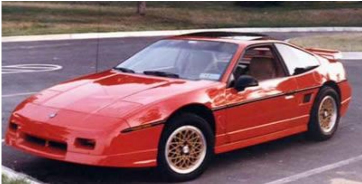
1988 Fiero GT

The Fiero is a model that GM worked for years to perfect, culminating with the 1988 release of the Pontiac GT. This model entered the market as a worthy sports car, though negative reviews of earlier versions of the car continued to plague sales of the vehicle. Still, the 1988 GT is the best model of the Fiero you can buy, and the collector's price tag is estimated to increase in the coming years. Article is from Odometer.com.