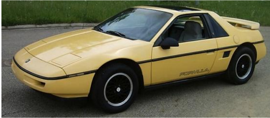
1988 Fiero Formula

So what is the range of prices for the sought after Fiero GTs?